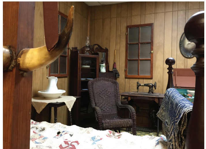
Home furnishings from the 1800s on exhibit in the Old Depot section of the Kaw City Museum