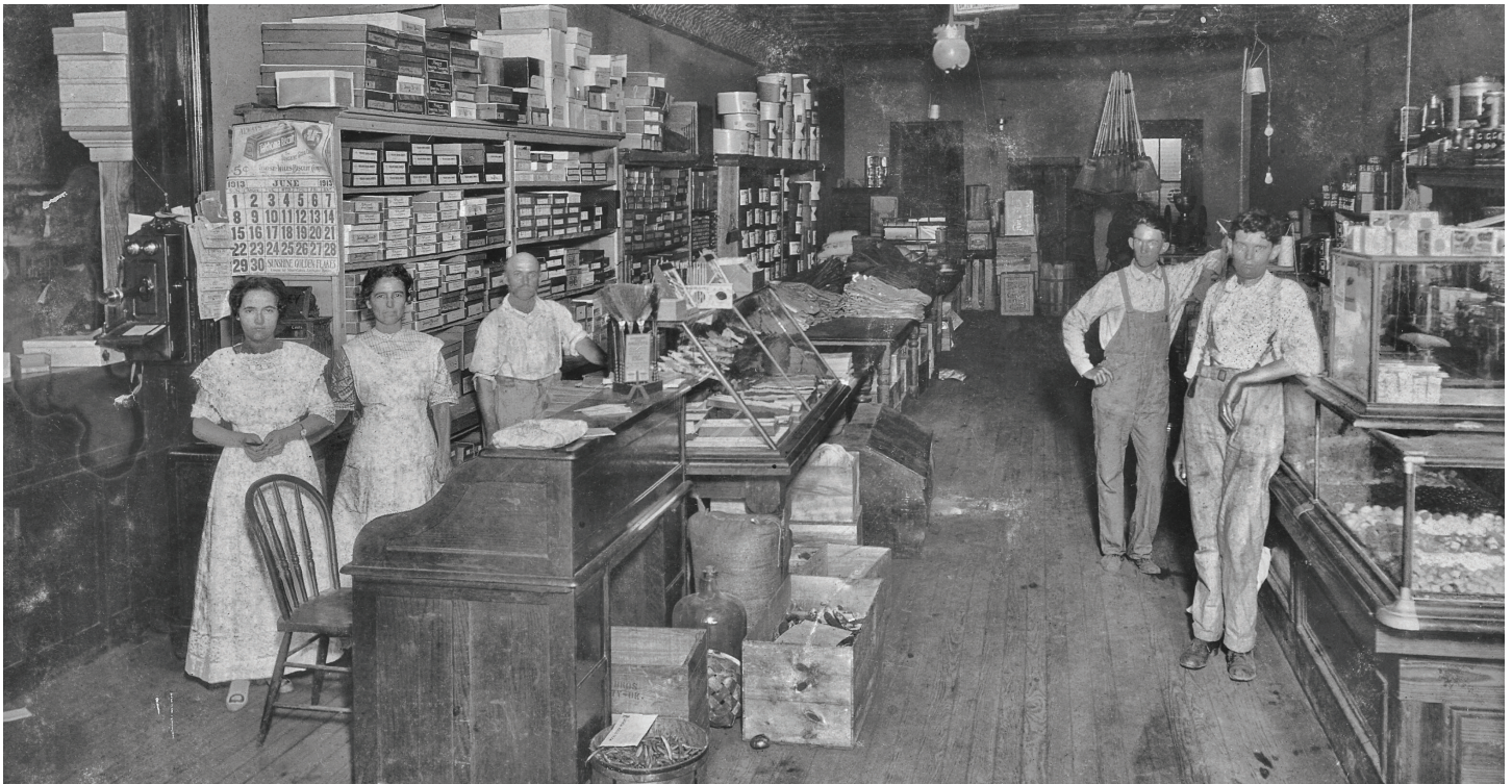
Wolf Grocery and Dry Goods Store on Kaw's Main Street in June 1913.