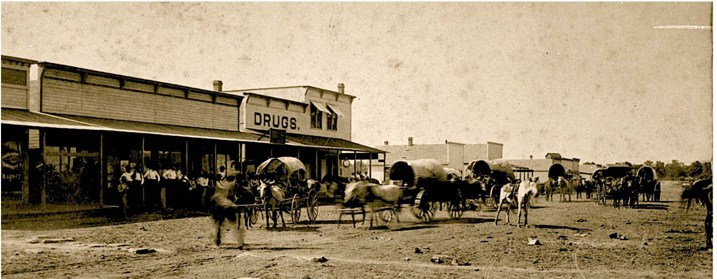
Horses and wagons were the main mode of transportation in 1903 as seen on the Main Street of Kaw City.