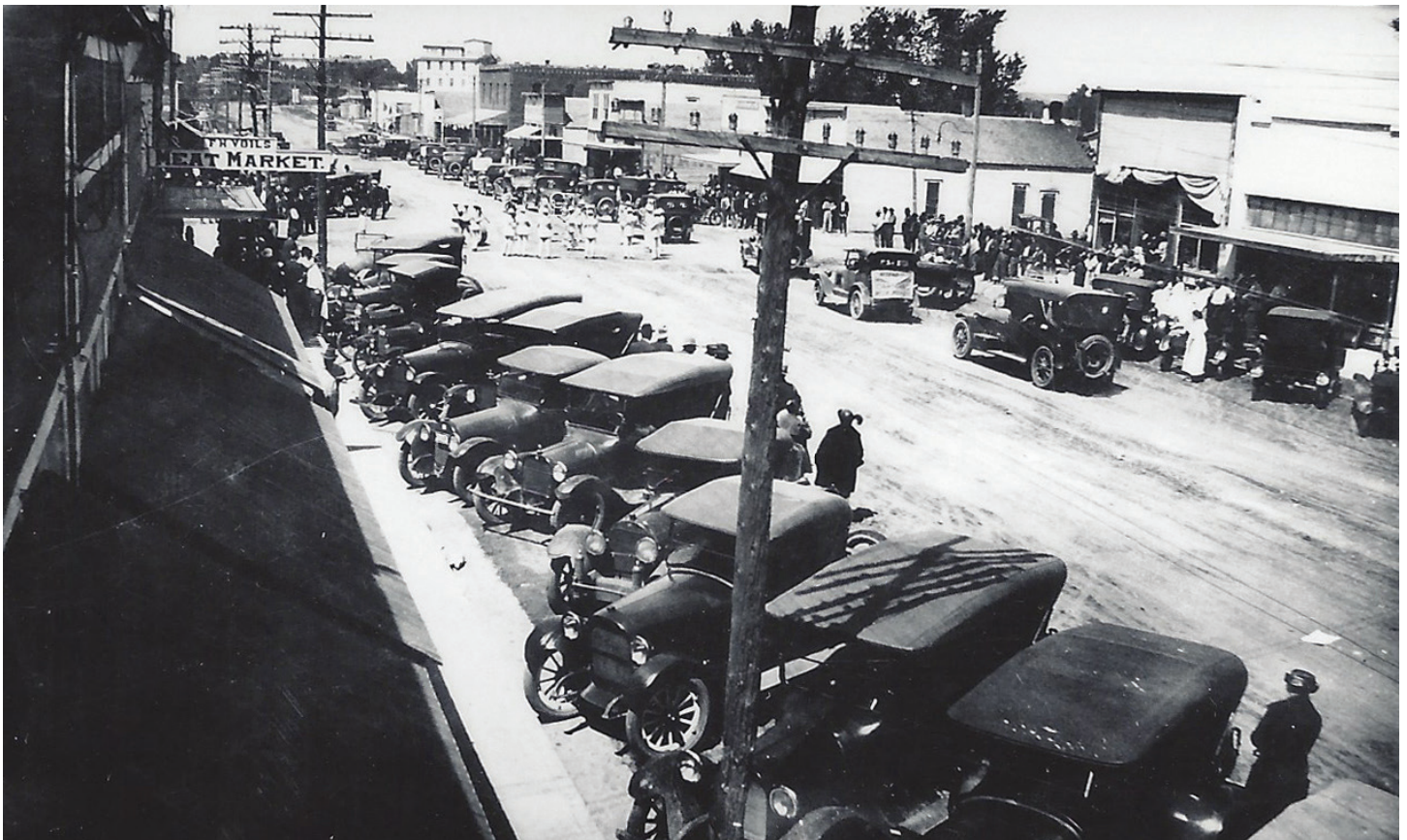
Main Street Parade - March 3, 1920. A parade advertising the upcoming Moose Lodge Carnival pauses on Main Street for the marching band to perform for the gathered townspeople.