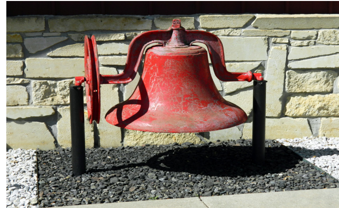
School Bell Painted Red in the 70's

The Kaw City School Bell that called children to school over a hundred years ago has graduated to its new home at the front entrance of the Kaw City Museum.