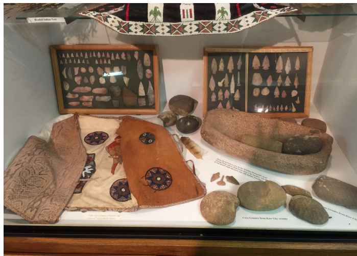
Arrowheads, Grinding Stones and Indian Vest