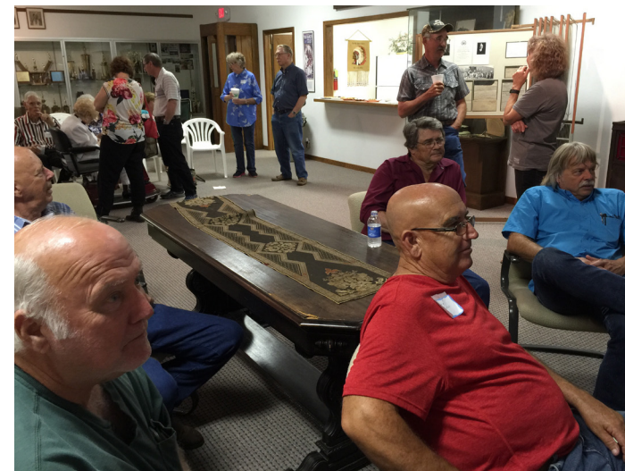
Board Members, volunteers and visitors sit back to relax and watch a video of Old Kaw City at last year's Memorial Day Reunion.

A selection of historical pictures and panoramic photos of the East and West sides of Old Main Street are available for purchase, as well as the Kaw City Cookbook, a DVD of historical photographs, and the two-volume Kay County history books, North Central Oklahoma, Rooted in the Past, Growing for the Future . The award-winning set of books, filled with pictures and stories of people and places from Kay County, is out of print, so purchase yours before they are gone forever. All proceeds go directly to the operating budget of the museum.