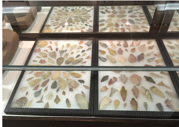
Part of the Gordon Smith Collection (on loan)

Several interesting arrowhead collections displayed in the museum, some dating as far back as 4,000 years ago, show many of the shapes, sizes and stones that were indigenous to the region. Ancient stone tools, beautiful Indian beadwork and historical photographs are also on exhibit.