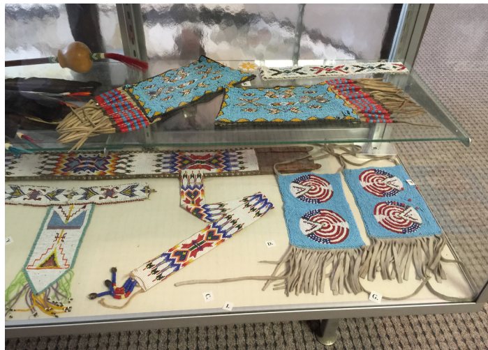
Hand Beaded Sashes, Belts and Pouches