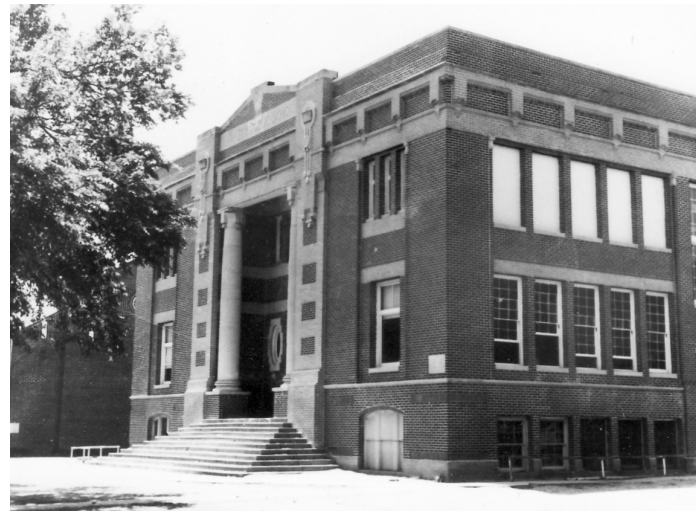
Third Kaw City School Building

The bell's rope was suspended through the roof and second floor, down into the first grade cloak room. First grade students were rewarded for good behavior with a chance to wrap their small hands around the thick rope and ring the bell. The fun came when the rope lifted them off the floor as the bell swung back and forth.